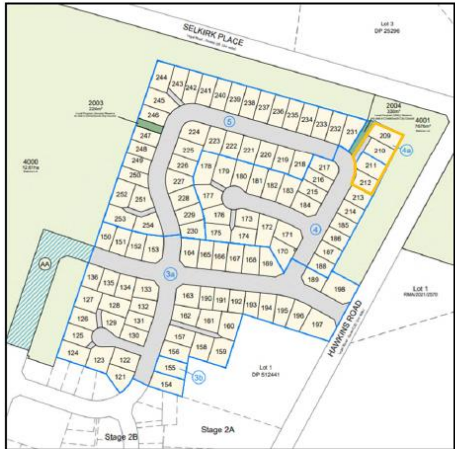
Figure 1: Extract from the Oakbridge Scheme Plan – Stages 3-5 (overall plan) (DWG 350/H). Not to scale. Subject lots outlined in orange.

Soils from Lots 209 to 212, stage 4 Oakbridge only, as characterised by supporting documentation.