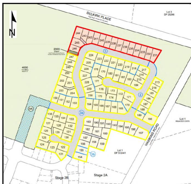
Figure 2: Modified extract from the Oakbridge Scheme Plan – Stages 3-5 (overall plan) (DWG 350/D) showing sampled areas as part of this investigation. Sampling was undertaken in lots shaded in yellow.

Red shaded lots were not ready for testing (had no placed topsoil) at the time of the investigation.